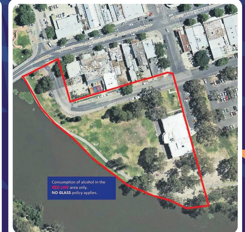
Consumption of alcohol in the RED LINE area only. NO GLASS policy applies.